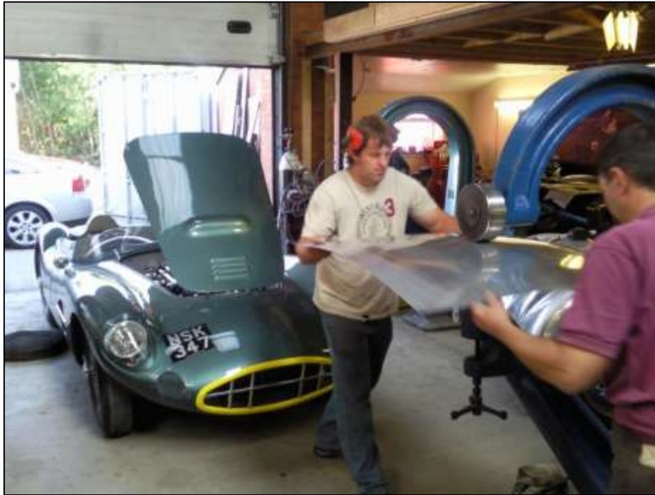
Making an Aluminium Boot to go on a GRP Body