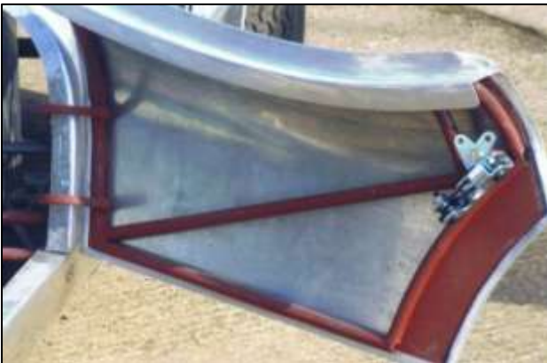
Inside Of Door