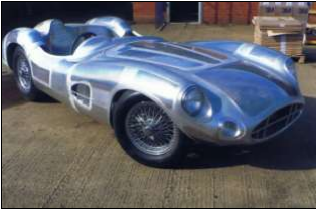
Front ¾ view